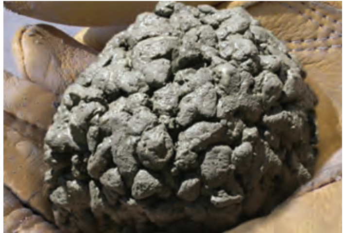
This sample has the proper amount of water

An approximate 6-to-1 or 7-to-1 ratio of stone to cement. Aggregate size can be 1/2 inch or 3/4 inch depending on the height of the structure. Use approximately 5 gallons of water for 100 pounds of cement. The design engineer will determine the specific mix.