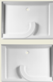
Right or Left Entry Available Size: 72"x51"