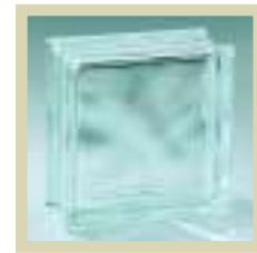
Premiere Series, DECORA® Pattern