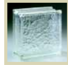
Premiere Series, IceScapes® Pattern