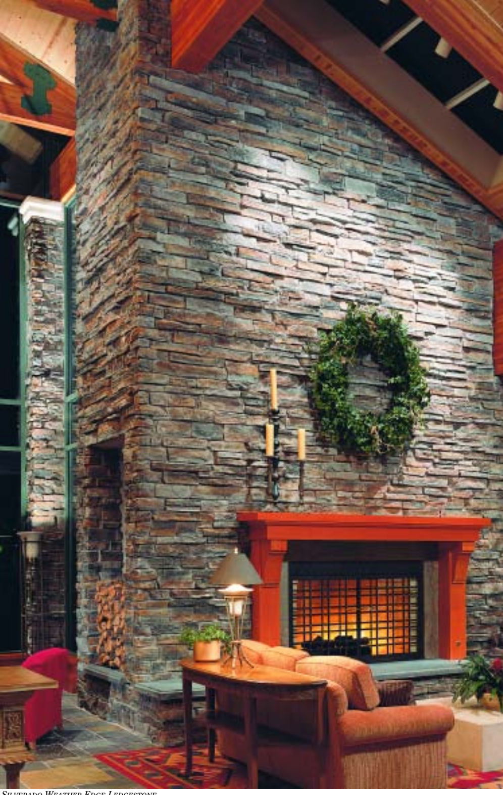
SILVERADO WEATHER EDGE LEDGESTONE