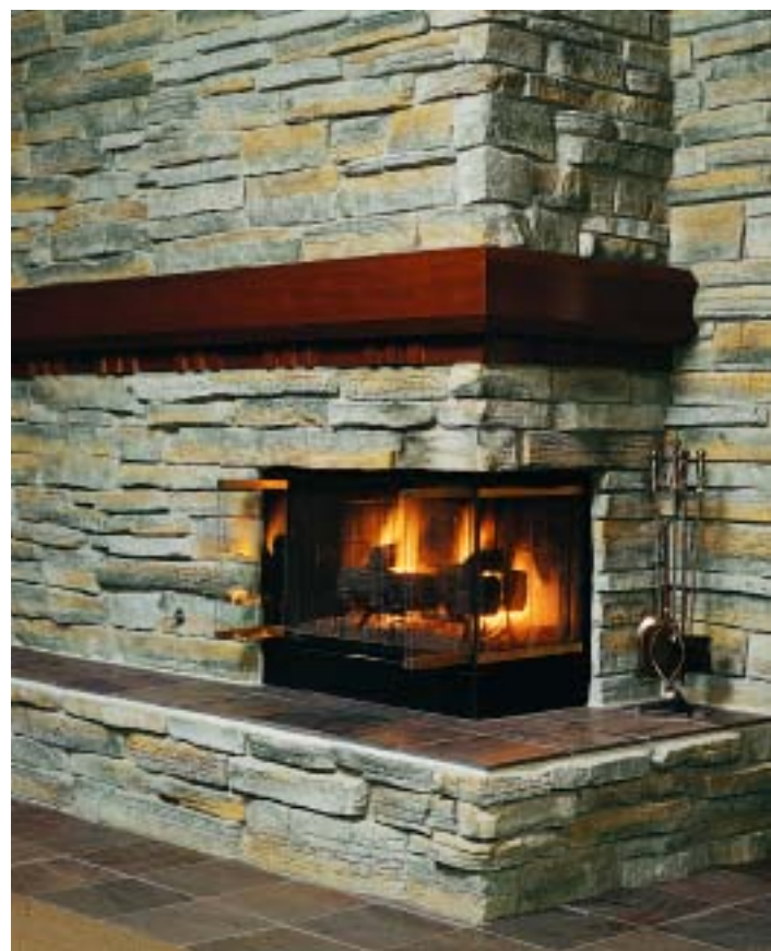
SILVERADO WEATHER EDGE LEDGESTONE