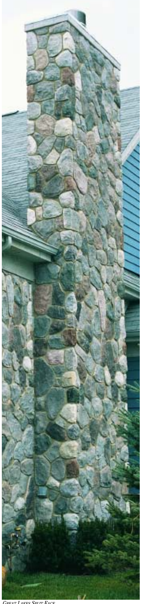
GREAT LAKES SPLIT FACE