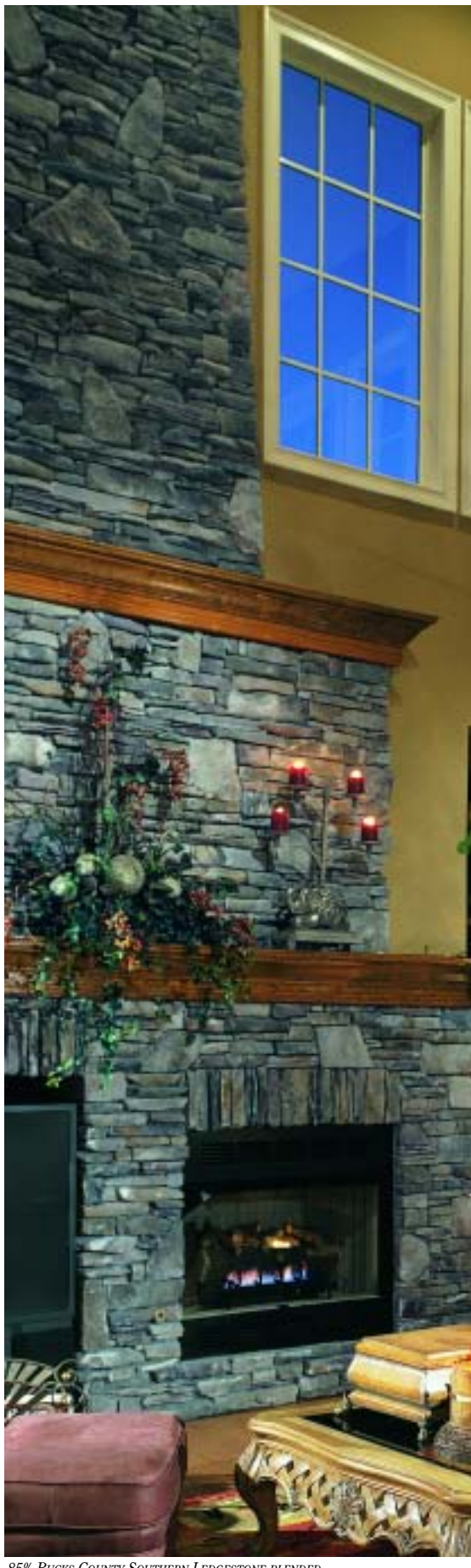
85% Bucks County Southern Ledgestone blended with 15% Bucks County Dressed Fieldstone