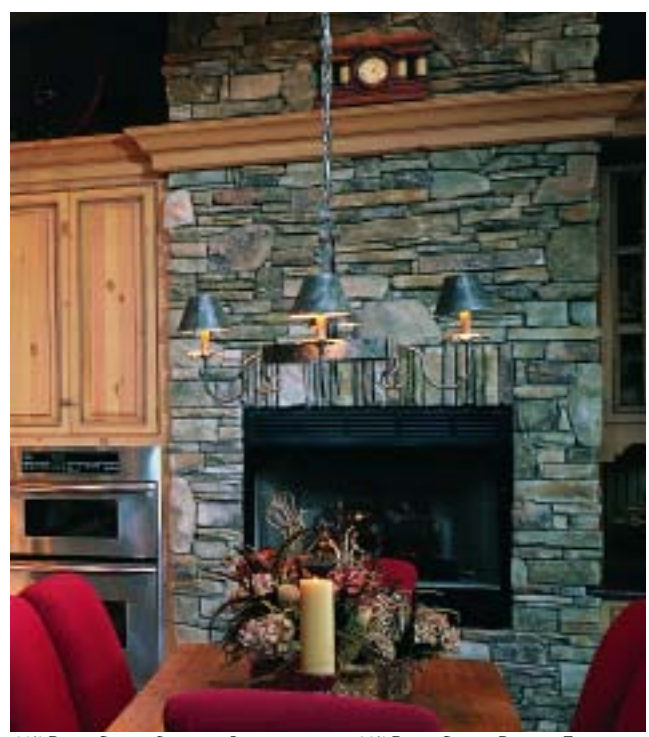
80% Bucks County Southern Ledgestone with 20% Bucks County Dressed Fieldstone Regular Driftstone with Drift Hearthstones