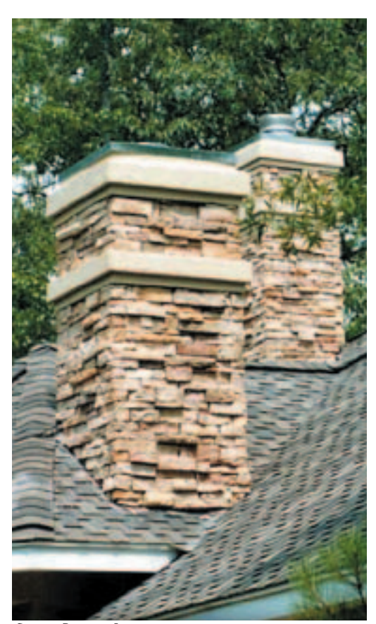
CARAMEL DRYSTACK LEDGESTONE