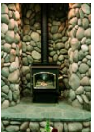
WINTER STREAM STONE