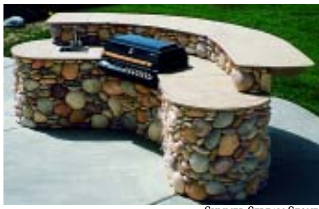
SUMMER STREAM STONE