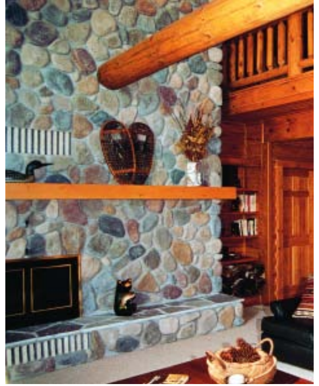
LAKESHORE RIVER ROCK