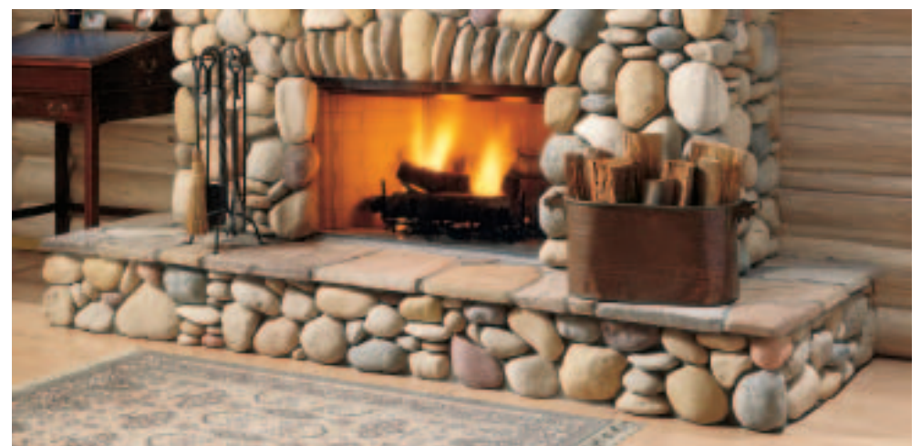
Summer Water Wash Pavers used as hearthstones with Summer Stream Stone, Standard size, 15% Skimmers

The product colors you see in this brochure are as accurate as current photography and printing techniques allow. We suggest you look at product samples before you select colors.