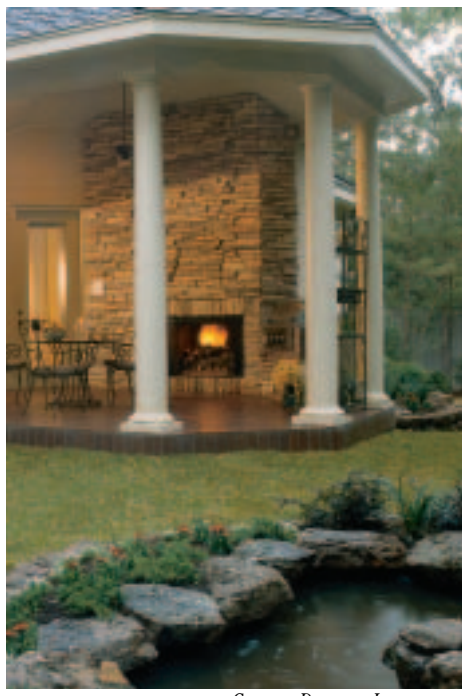
CARAMEL DRYSTACK LEDGESTONE