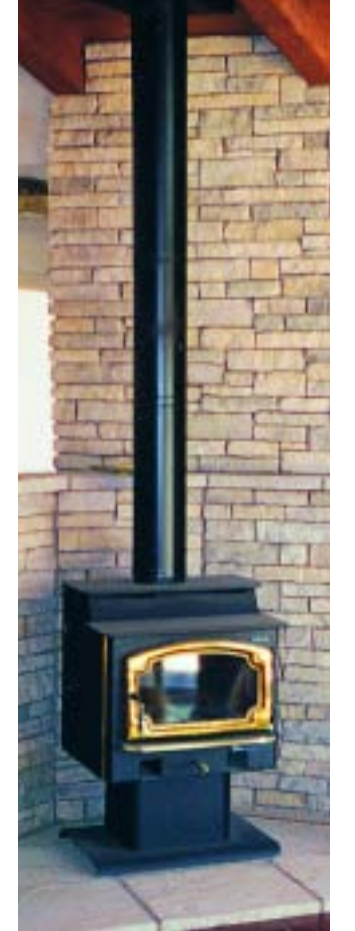
CHARDONNAY DRYSTACK LEDGESTONE