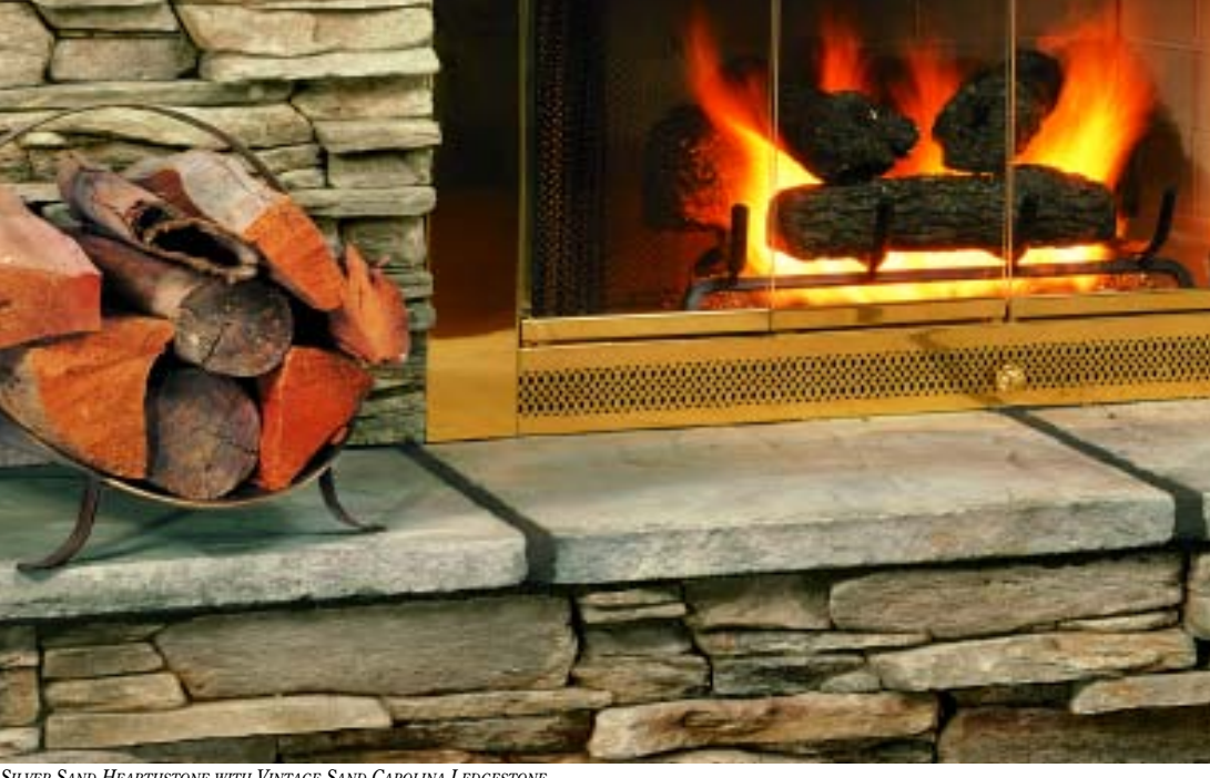
SILVER SAND HEARTHSTONE WITH VINTAGE SAND CAROLINA LEDGESTONE