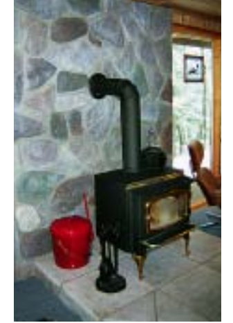
GREAT LAKES SPLIT FACE WITH GREAT LAKES HEARTHSTONES