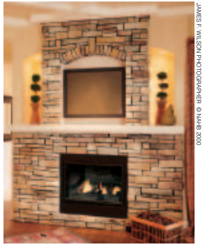
CARAMEL DRYSTACK LEDGESTONE