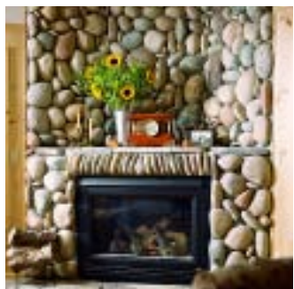
WINTER STREAM STONE WITH SKIMMER LINTEL