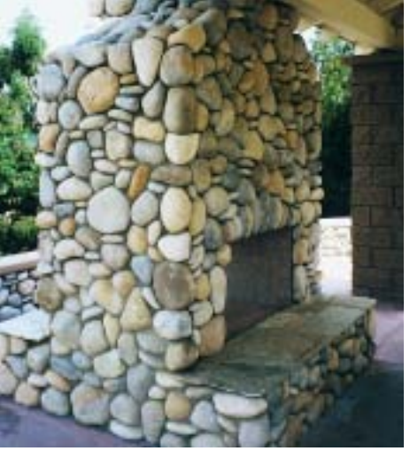
Winter Stream Stone with 15% Skimmers