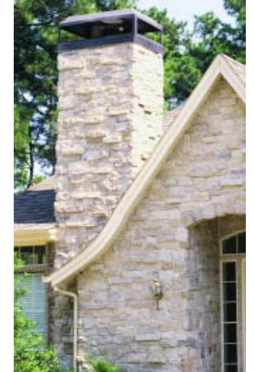
TEXAS CREAM COBBLEFIELD®