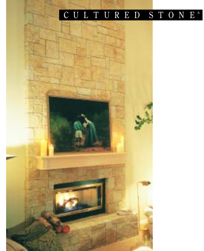
GOLDEN BLEND EUROPEAN CASTLE STONE