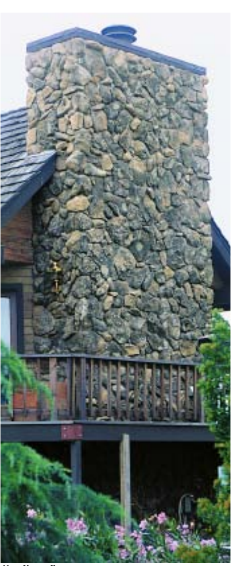
NAPA VALLEY FIELDSTONE