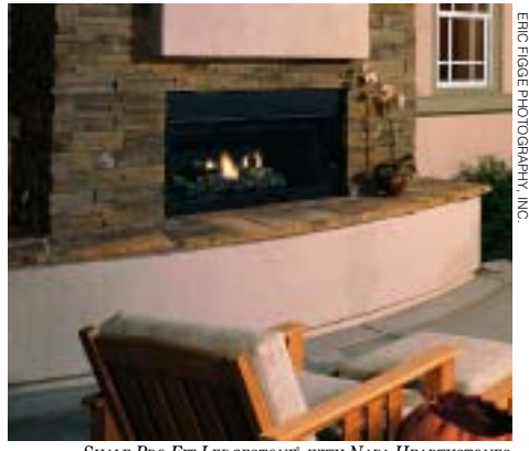
SHALE PRO-FIT LEDGESTONE® WITH NAPA HEARTHSTONES