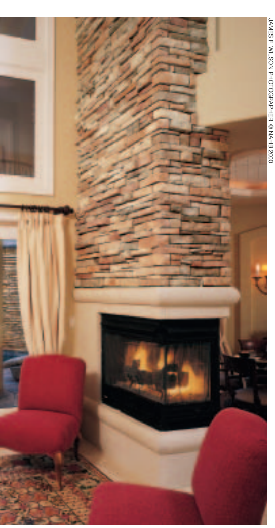
CARAMEL DRYSTACK LEDGESTONE

Rustic or formal, ambitious or unassuming, Cultured Stone* fireplaces make almost any space more inviting. On these pages, 36 different fireplaces for 36 very different homes.