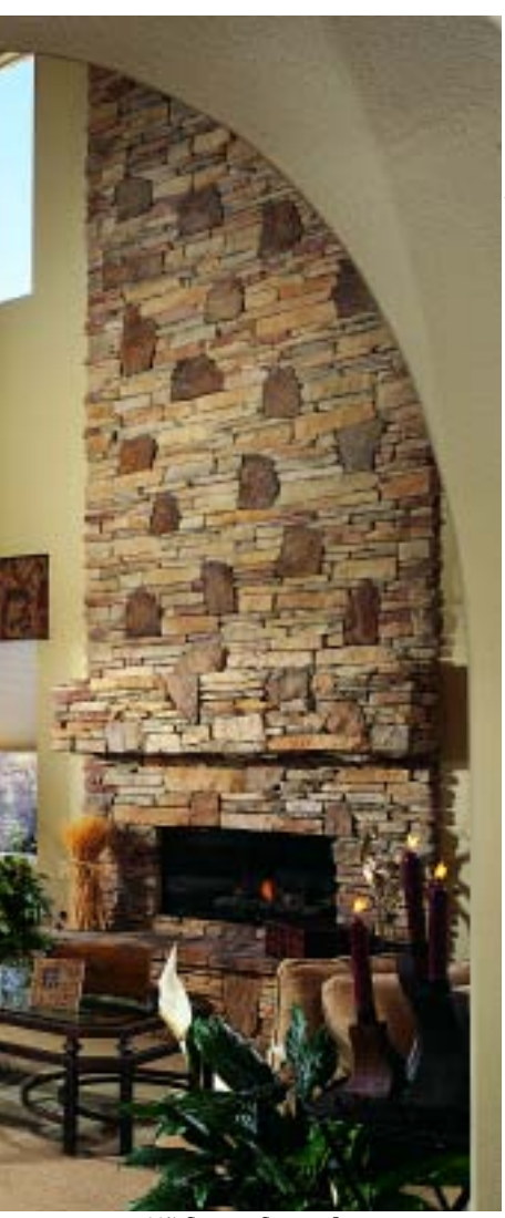
80% Caramel Country Ledgestone blended with 20% Brandywine Dressed Fieldstone and Drift Hearthstones

Each Cultured Stone' color and texture is made of its own blend of Portland cement and natural aggregates, cast in molds taken from carefully-selected natural stone. Even on the closest examination, Cultured Stone' wall veneer looks and feels exactly like the natural stone that inspired it.