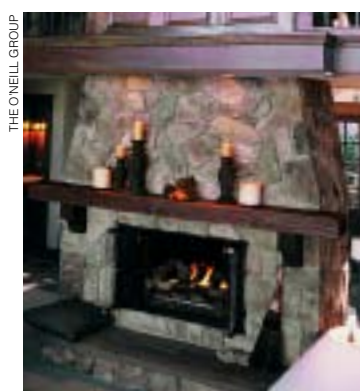
BUCKS COUNTY DRESSED FIELDSTONE