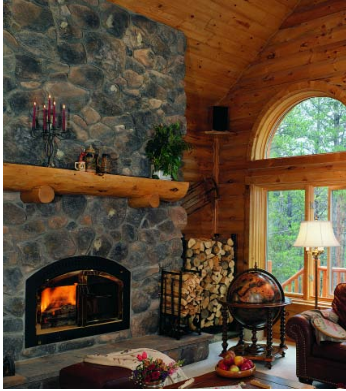
Napa Valley Fieldstone with Napa Hearthstones