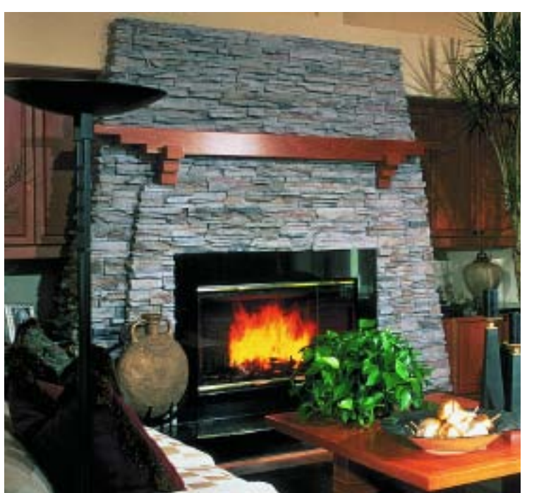
PEWTER GRAY CAROLINA LEDGESTONE