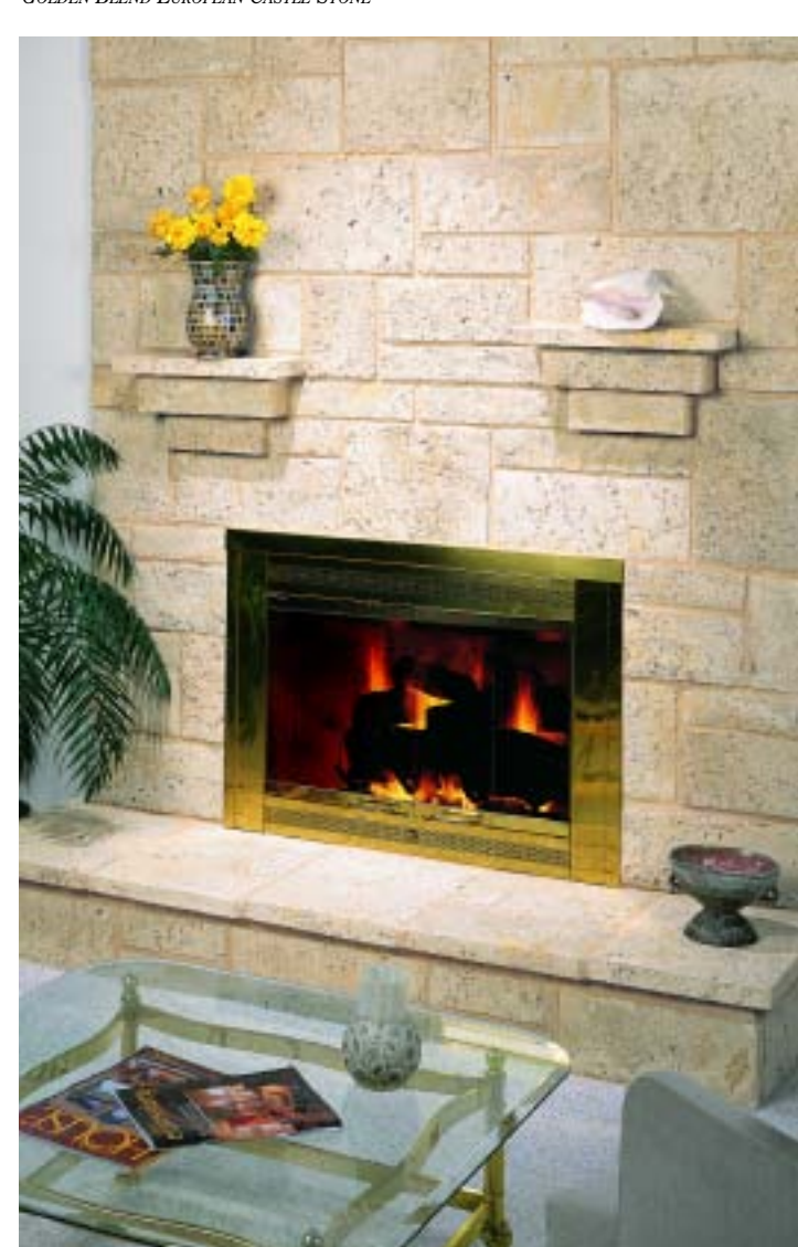
FOSSIL REEF CORAL STONE