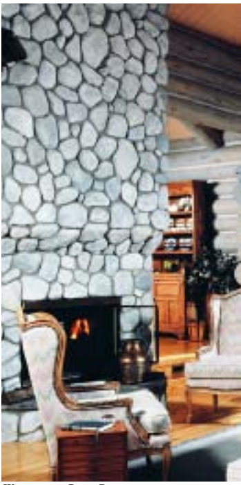
Whitewater River Rock